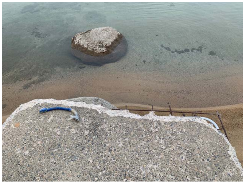
Erosion of Concrete deck and exposed rebar.