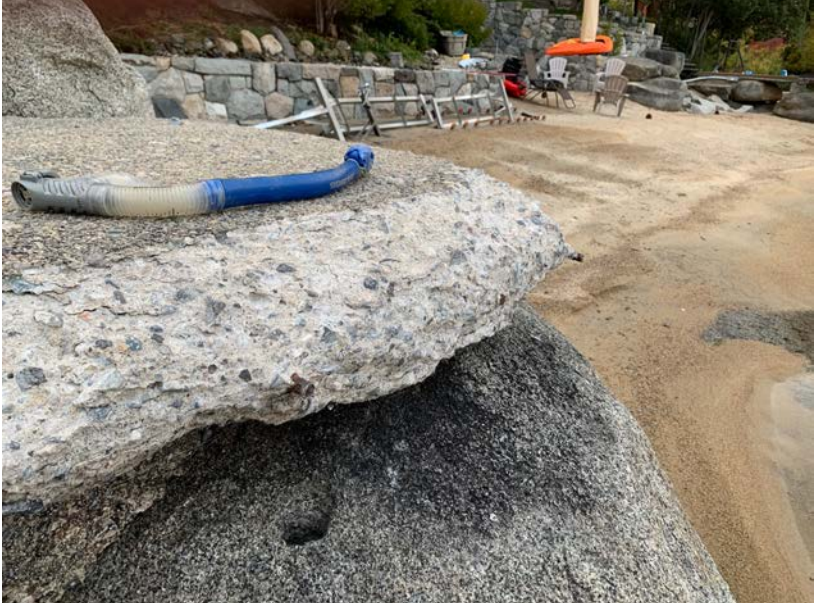
Concrete has only eroded to the end of the rebar.