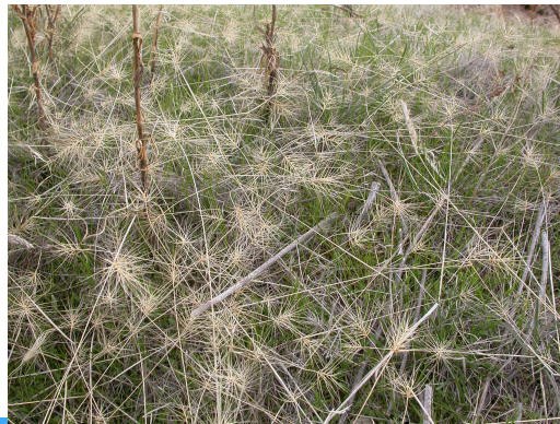
Category B-Medusa Head