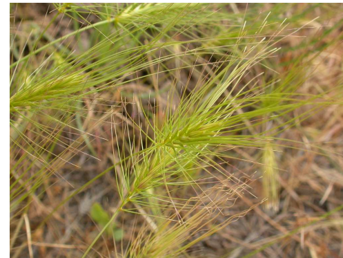
Category B-Medusa Head