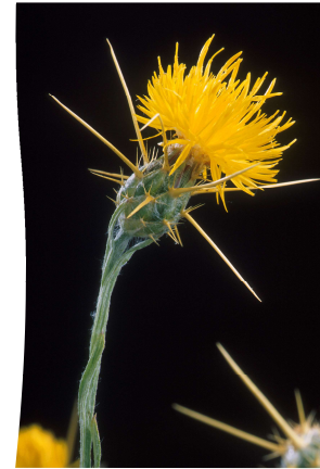
Category A- Yellow Star thistle