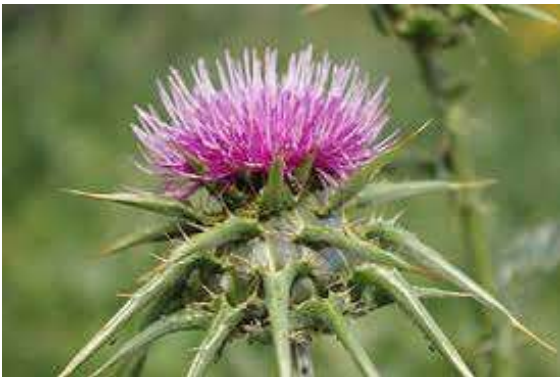
Category B-Musk Thistle