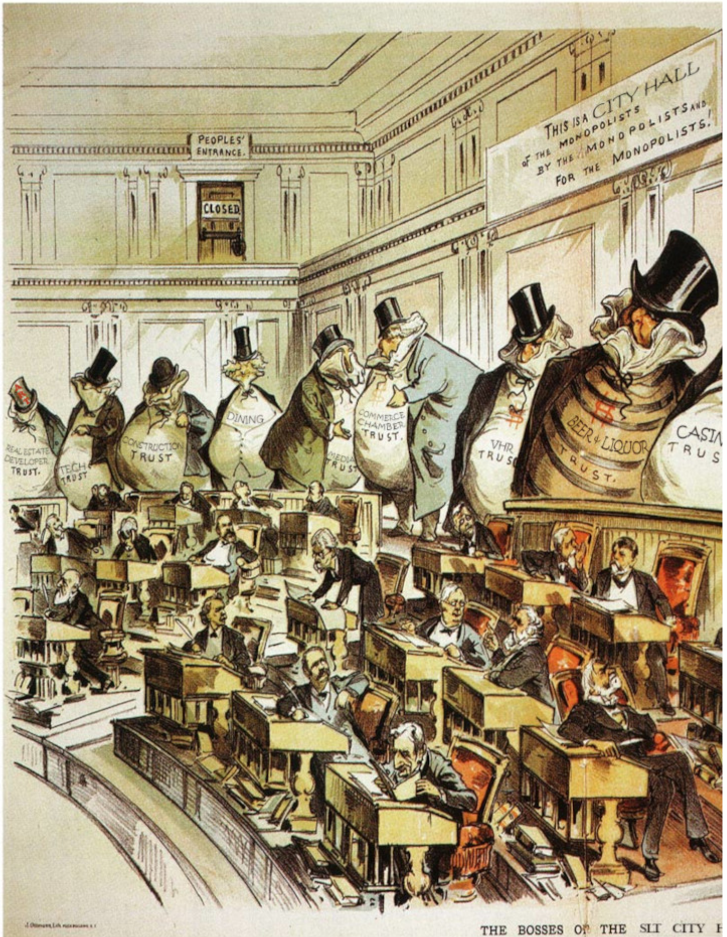
THE BOSSES OF THE CITY